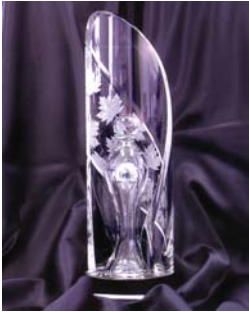
Parks Canada Sustainable Tourism Award