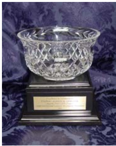
Excellence in Collaboration Award

The Joggins Fossil Cliffs Project was singled out as one of Nova Scotia's shining examples of community collaboration and development at the 2007 Celebrating Communities Conference in Sydney.